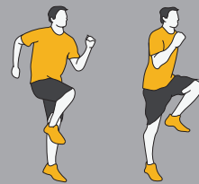
High Knees 30 seconds x 3 sets