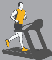
Treadmill 10-15 minutes

Improve heart health and increase your metabolism by performing one of the following exercises.