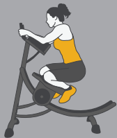
Ab Machine 8-10 reps x 3 sets

Add some weight to help build muscle. Increased weight means decreased reps.