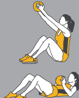
Weighted Sit Up 8-10 reps x 3 sets